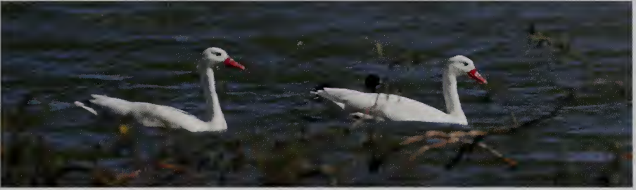
Figure 2. Coscoroba Swan Coscoroba coscoroba , laguna Capirenda, near Boyuibe, dpto. Santa Cruz, July 2005; the first documented record for Bolivia (J. A. Tobias)